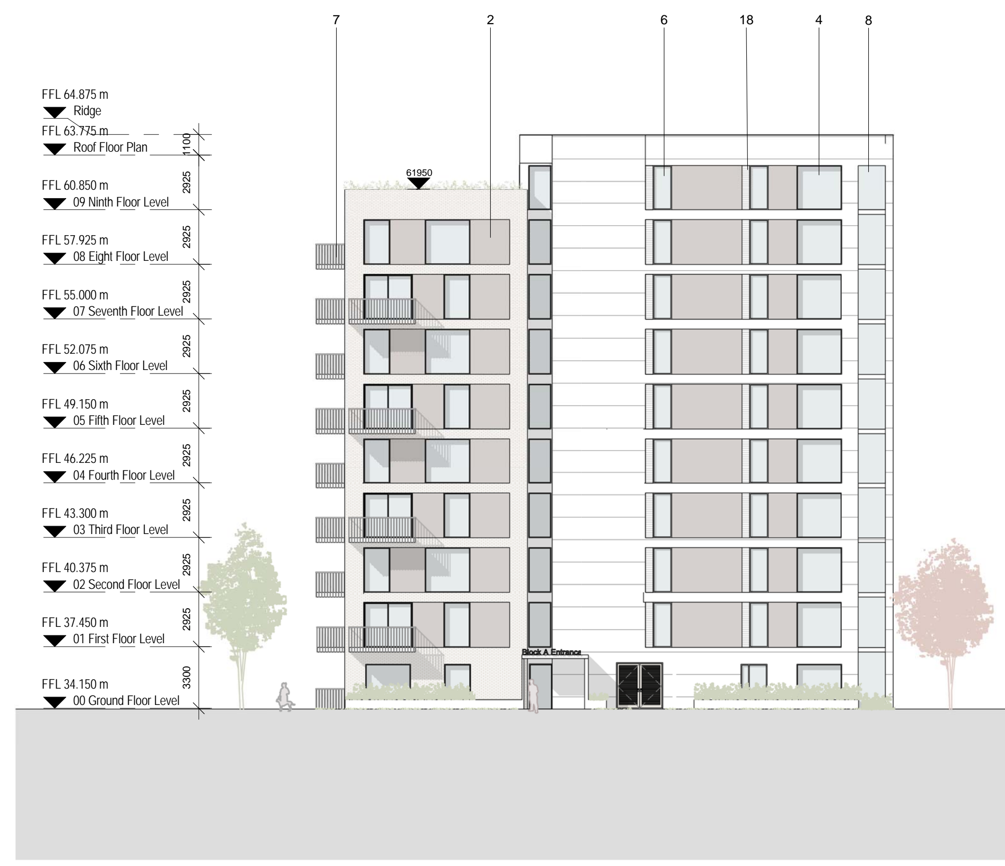
1 Elevation SE 1 : 200