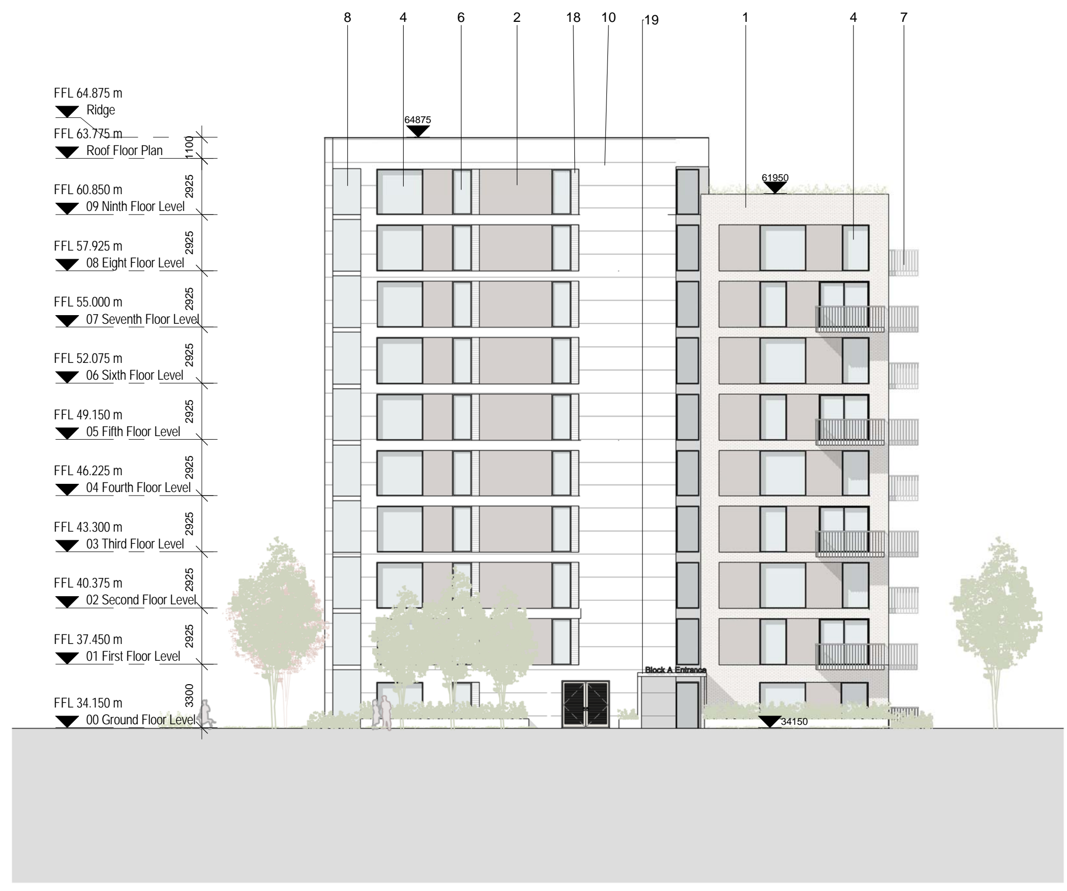
2 Elevation NW 1 : 200

NOTES: Copyright of this drawing is vested in the Architect and it must not be copied or reproduced without consent. Figure dimensions only are to be taken from this drawing. All dimensions must call out and be responsible for taking and checking all dimensions relative to each wall. Plus Architecture do not warrant any of the information herein drawn and the conditions DO NOT SCALE OFF THIS DRAWING. - P IS DOUBT ASK